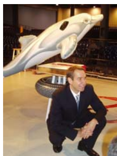
Artist and Sculptor Jeff Koons with his sculpture "Radial Champs" only available with GOAT—Greatest of All Time: Muhammad Ali, Champion Edition.