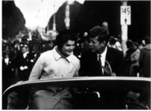
Senator John Kennedy and wife Jackie campaigning through Boston