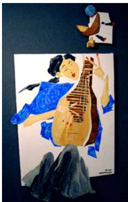
^ Schlossberg-Cohen’s Pipa Player, 2003, Acrylic Cut-outs on Canvas.