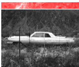
At the 2004 Photography Show in Los Angeles, Bob Kolbrener released only 5 signed and limited gelatin silver prints of Cadillac, a lost treasure along the highways of UTAH. Contact GALLERY M for more details.

(Continued from page 1) ages have. The popularity of images like Alfred Eisenstaedt's Ice Skating Waiter, The Drum Major, Premier at La Scala; Mydans' historically important Japanese Surrender on the USS Missouri, 1945; or Bourke-White's Hat's in The Garment District 1 have increased in price because the signed, limited edition works are nearing the end of their signed edition size. (signed edition size is different than full edition as a photographer might have only signed 50 when the full edition allowed for 250 before he/she had passed on). With fewer signed images, the price moves