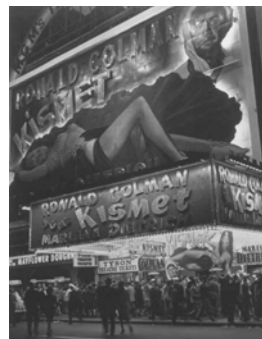
^ Marlene Dietrich Kismet Billboard 1944, Gelatin Silver Print by Andreas Feininger .