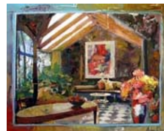
Day's A Room of Light, Original Collage and Gouache on board, 13

Windows of Dreams is set to open with over 10 new original paintings along with Arless Day's very small edition unique variations (typically only 2 or 3 to an edition—although each has original elements reserved for each work. Make sure to RSVP for the show.