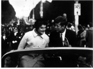
Senator John Kennedy and wife Jackie campaigning through Boston