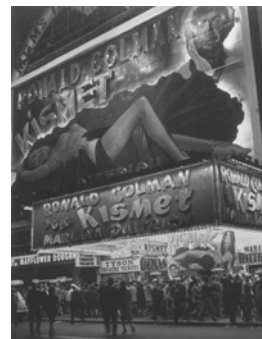
^ Marlene Dietrich Kismet Billboard 1944, Gelatin Silver Print.