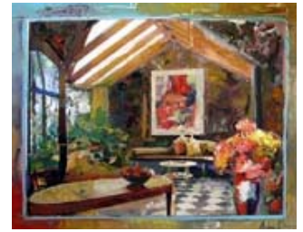
Day's A Room of Light, Original Collage and Gouache on board, 13

Windows of Dreams is set to open with over 10 new original paintings along with Arless Day's very small edition unique variations (typically only 2 or 3 to an edition—although each has original elements reserved for each work. Make sure to RSVP for the show.