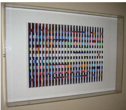
^ Day and Night, Signed, Limited Edition Polymorph by Yaacov Agam.

In over 40 years, International fine artist Yaacov Agam has strategically placed monumental works throughout the globe. From transit authority installations like New York City's Port Authority, Chicago's disputed plaza installations, Paris, Jerusalem and yes Denver's Cherry Hills Neighborhood (Jacob's Ladder is a work controlled by a seemingly pre-historic, 1980s Apple computer) Agam holds a public space like no other.