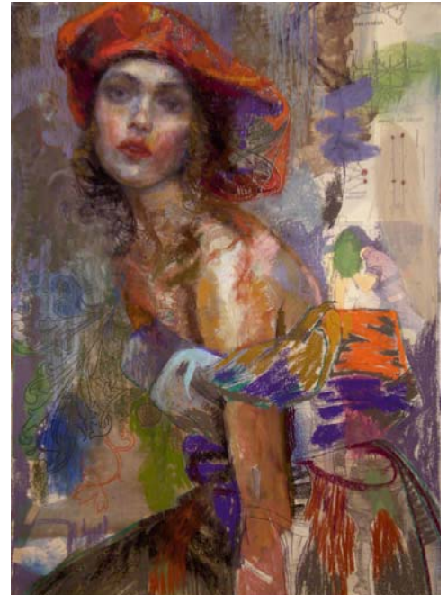
^ Dwyer’s pastels invite reflection and wonder as to the moment envisioned by he and his muse.

His forms, both abstract and typically elegantly painted, delicate women, guide collectors to find youth and glory with each work before them. Men and women gravitate to Dwyer’s style due to the mixing of texture, form and flow of each subject. Contact GALLERY M to have a first glance at each original as they become available for the February 2008 show in Denver.