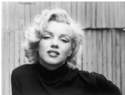
Marilyn Monroe, 1953 > DETAILS