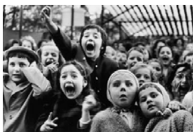
Children at Puppet Theater by Alfred Eisenstaedt > SOLD