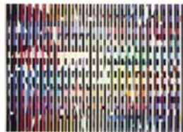
Day and Night by Yaacov Agam > DETAILS