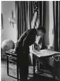
John F. Kennedy in the Oval Office, 1961 by Alfred Eisenstaedt > DETAILS