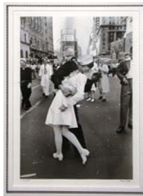
V.J. Day—The Kiss, Gelatin Silver Print by Alfred Eisenstaedt > DETAILS