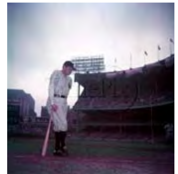
^ Babe Ruth Leans on Bat, 1948—Cibachrome Print, Limited to an edition of 250, by LIFE photojournalist Ralph Morse