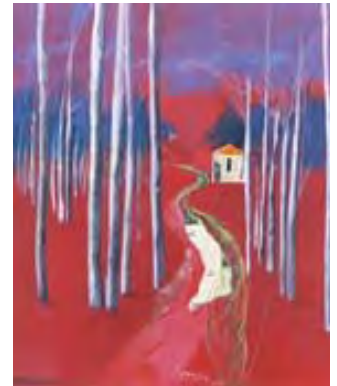
Regina's Febrer, Original Mixed Media on Canvas, 47 H x 39 W"

Monprints & Serigraphs: http://www.gallerym.com/srpixs.htm