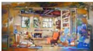
Gentleman's Retreat — Goauche and Collage original only at GALLERY M