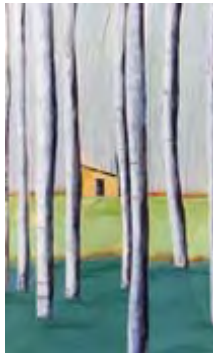
Regina's Mixed Media Originals include Entre Xops, 59"H x 36" W