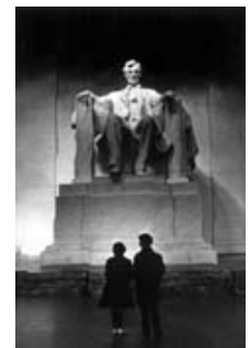
Young Americans visit the Lincoln Memorial, Gelatin Silver, 11 x 14 by Carl Mydans

What makes a LIFE vintage photograph different from a modern print? While a few factors exist, the photograph could have been part of the magazine's production. Typically this image has unique markings that the photographer, editors or archivist affixed while reviewing the image. GALLERY M is proud to offer Bourke-White and Mydans vintage photographs that are in excellent condition and backed with proper LIFE documentation.