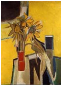
Les Soles, Oil on Canvas by Francoise Gilot