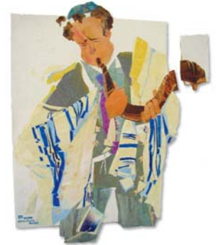
Schlossberg-Cohen's Tkiyah Gdolah, 30"W x 40" H, Acrylic Canvas Cut-Outs on Canvas

* GALLERY M's Alexa ranking is 470,664 as of 9/3/2004. Visit Alexa for details.