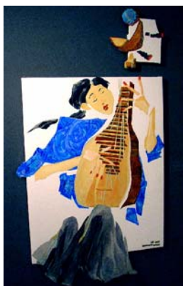
^ Schlossberg-Cohen's Pipa Player, 2003, Acrylic Cut-outs on Canvas.