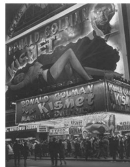
^ Marlene Dietrich Kismet Billboard 1944