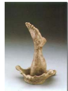
^ DIVE—Bronze Sculpture by David Phelps