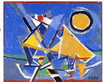
Bateaux 1, Original Oil on Canvas, 8" H x 10" W by Francoise Gilot.

Picasso and later married to Dr. Jonas Salk. Although Picasso had differing opinions of her talent, Gilot works capture the "retro" 50's, 60's and 70's art styles. Her collages, drawings and oils join abstract and realist movements of the time. Gilot's available works are in the gallery through September 31 and online.